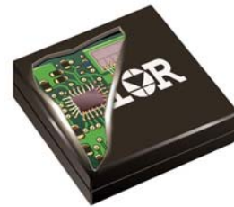
iP2002 Power Block