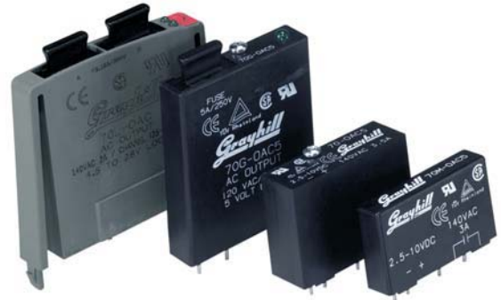
70L-OAC 70G-OAC 70-OAC 70M-OAC